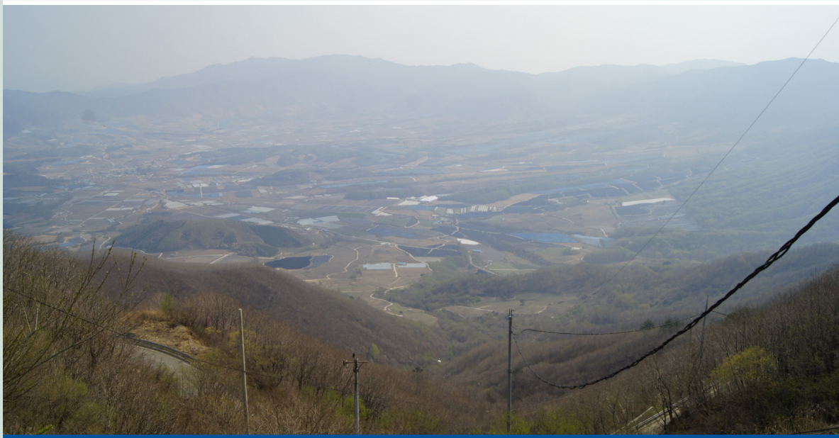
Punchbowl Valley. The site of several battles during the Korean War.

Korea, Japan, Hong Kong, and the U.S. met in South Korea to plan for the April 2014 Forum.